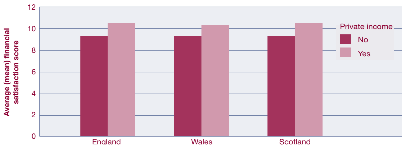
Figure 2: Financial satisfaction of older people with and without private sources of income in England, Wales and Scotland