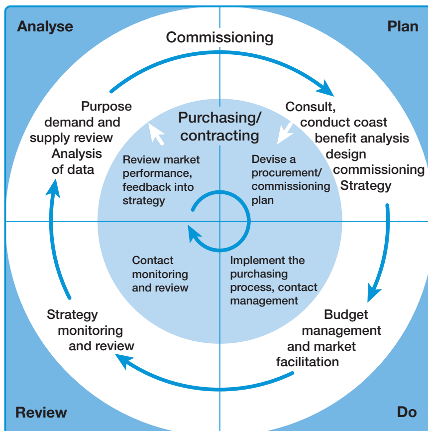
Figure 2: The Commissioning and Contracting Framework.

In process terms, social care commissioning has also traditionally been described as a continuous cycle of interlocking elements. Probably the best-known example in currency during the study reported here is that produced by the Institute of Public Care (IPC) at Oxford Brookes University for the Community Services Improvement Programme of the Department of Health (CSIP, 2007a). Like the NHS commissioning cycle, it comprises a number of distinct elements related to each other as depicted in Figure 2. Three features are particularly noteworthy. First, it seeks to represent the interrelationship