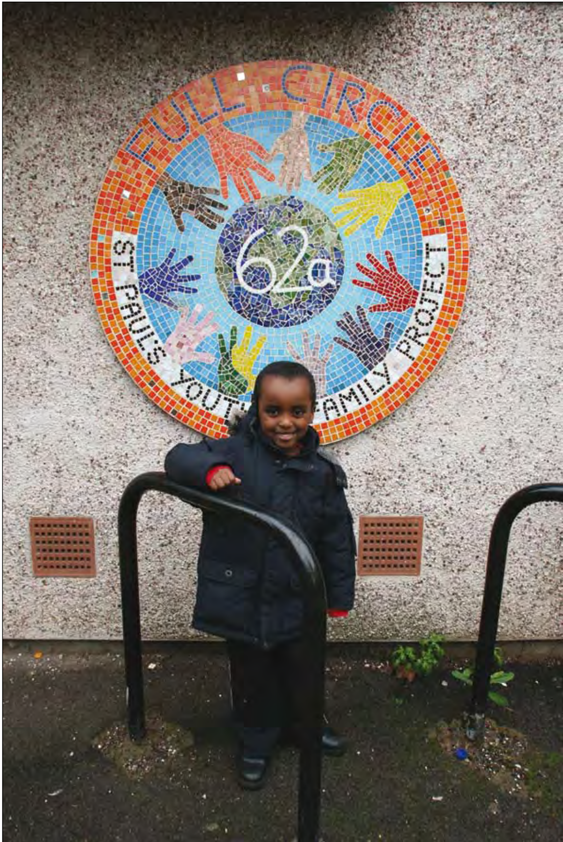
An eye-catching mosaic for Full Circle, the Youth and Family Project in St Pauls, Bristol