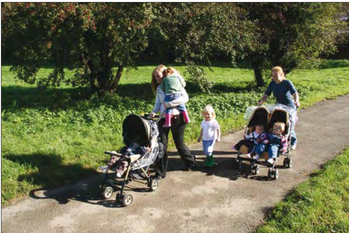
Enjoying the sun: taking the kids out for a stroll on the edge of Scarborough's very large out-of-town Eastfield estate

Several of the earlier learning points relating to the development of sustainable community organisations also have implications for public authorities.