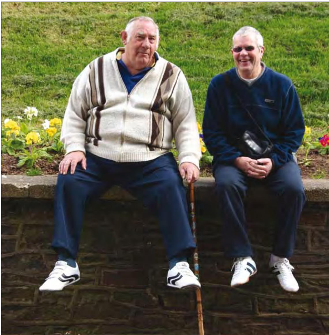
Hangin' out in Ty Sign, Caerphilly: two friends stop for a catch up

The setting-up process also took longer than expected. Any new programme has to balance the need to allow time for development with the need to get the show on the road and make visible progress. But even though JRF research has consistently criticised the lack of development time in government programmes, they still had to learn this lesson first hand. However, unlike many other funding programmes, the Foundation was flexible enough to respond by extending the Programme's life by a year in order to accommodate the time it (always) takes to get programmes up and running.