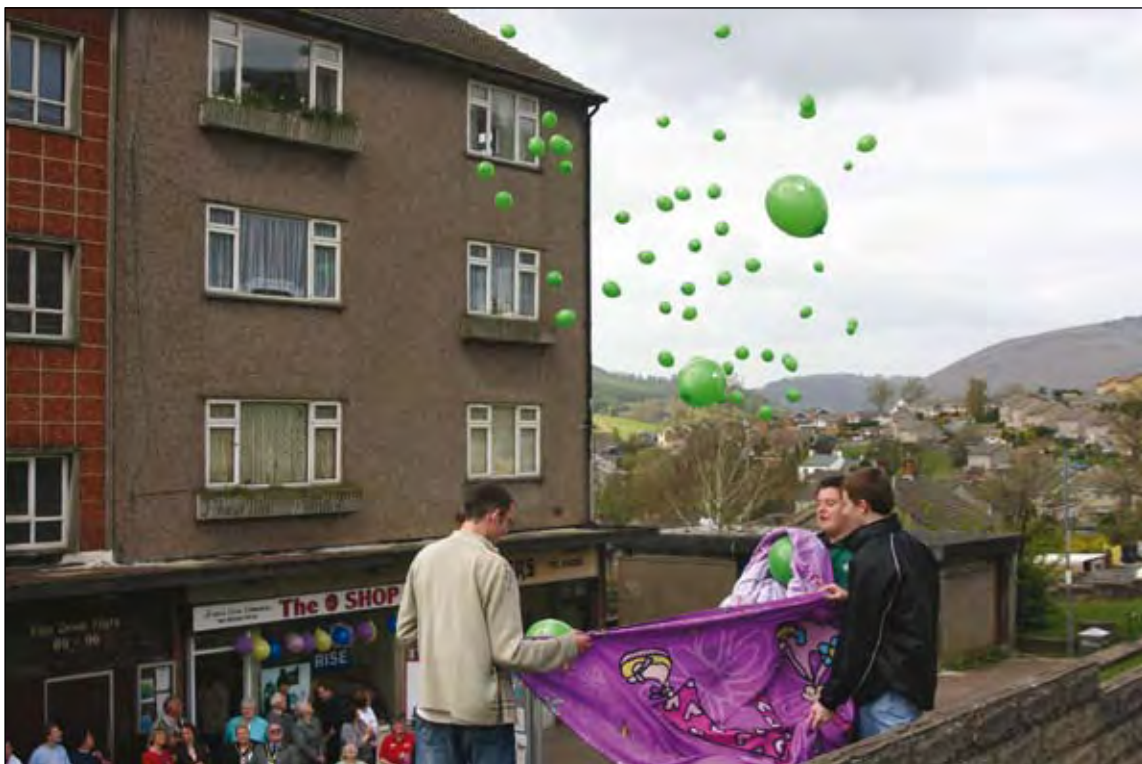
Away they go! Balloons being released at the opening of Ty Sign's community shop

Organisations in the Programme have tackled these issues in a number of ways, which are examined in detail on pages 24-29.