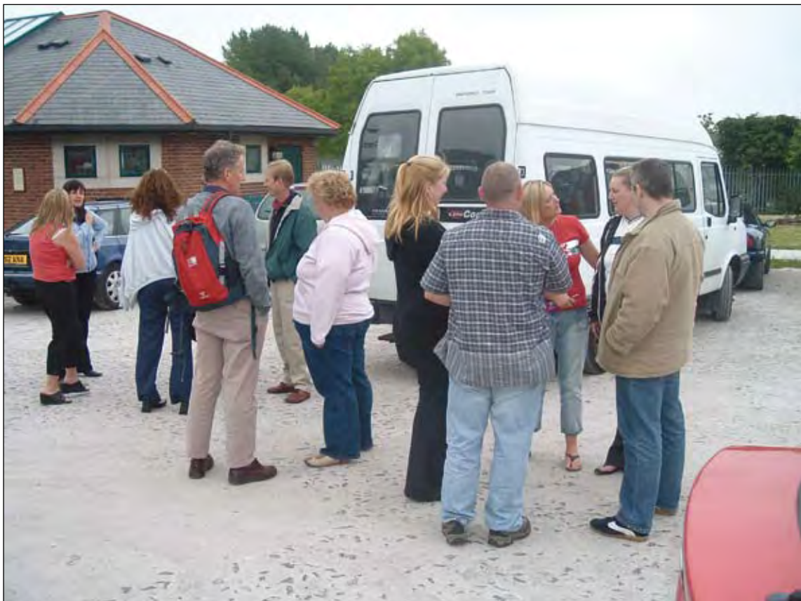
A visit to Caia Park in Wrexham, where the local partnership delivers a wide range of services: 70% of its employees are residents

There are inevitable tensions between existing power structures and community organisations who want to maintain the right to challenge as well as find ways of working with decision makers and service providers for the benefit of the community. The evidence from the Programme suggests that community organisations as well as power holders need to be challenged if a new settlement is to be reached at neighbourhood level. Several of the Programme participants have increased their knowledge about how the system works and have more confidence in dealing with power holders. Some are winning over previously sceptical local authorities just by ‘being good at what they do’. However, the Programme has also shown that, although progress can be made on a case-by-case basis, power holders readily revert to