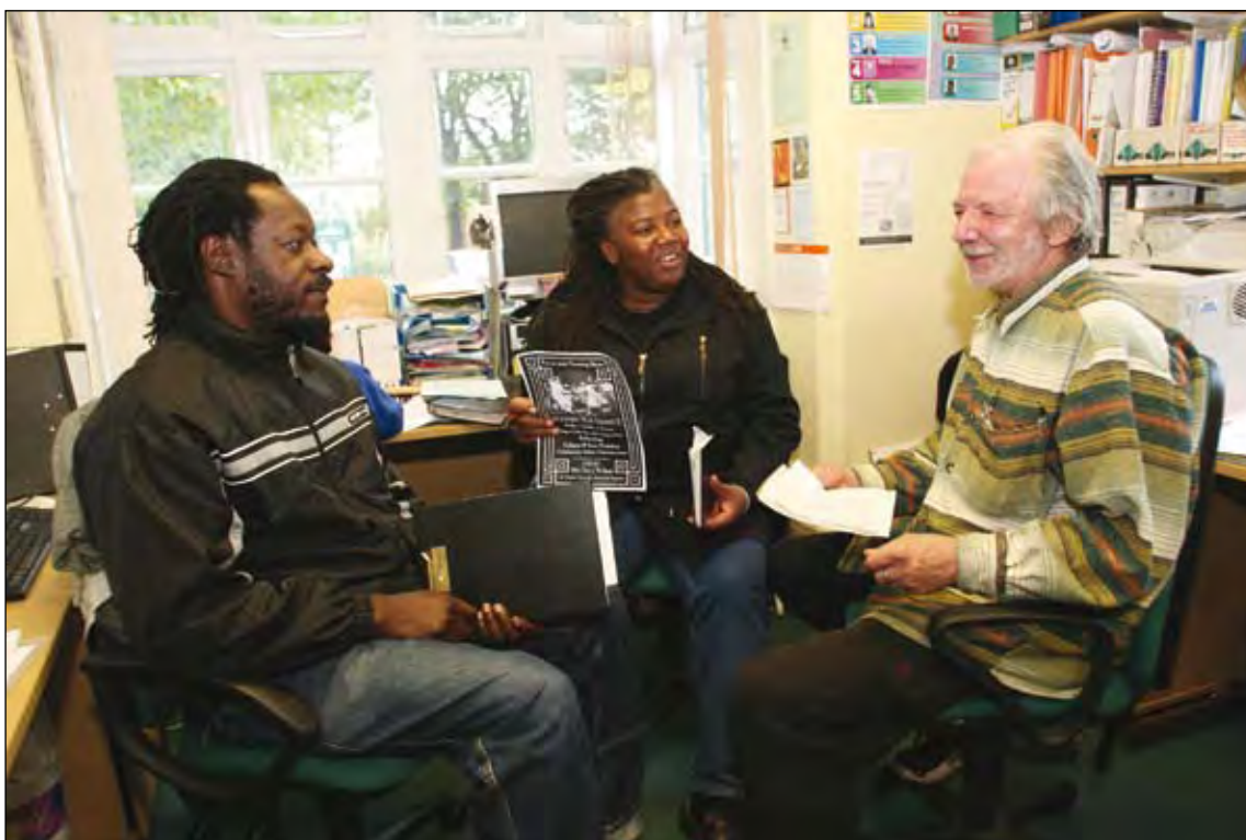
Resident activists in a meeting at the St Pauls Unlimited offices