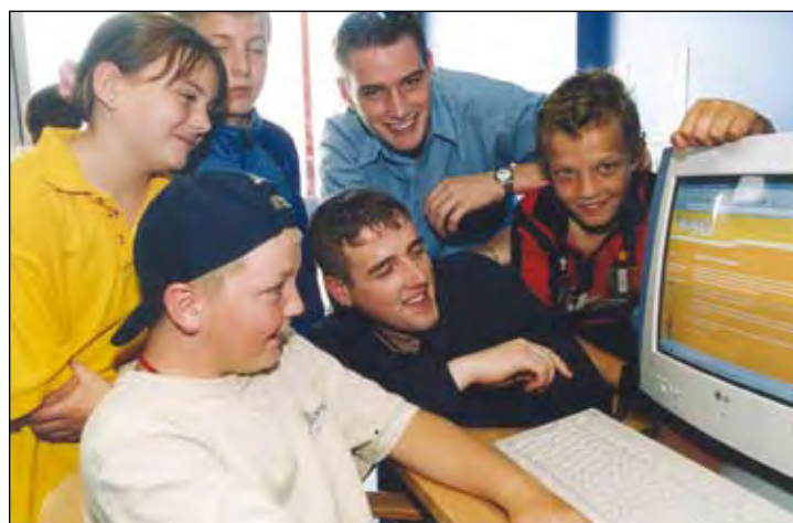
Young people at the launch of the Castle Vale database

Castle Vale Community Housing Association has appointed an equalities and diversity coordinator that has given it the capacity to engage a range of groups in partnership work and service delivery. It has also set up a Youth Council, which is providing tasters for engagement with the Neighbourhood Partnership Board and it convenes a practitioner group on young people. It is now seeking to spread this practice into other agencies.