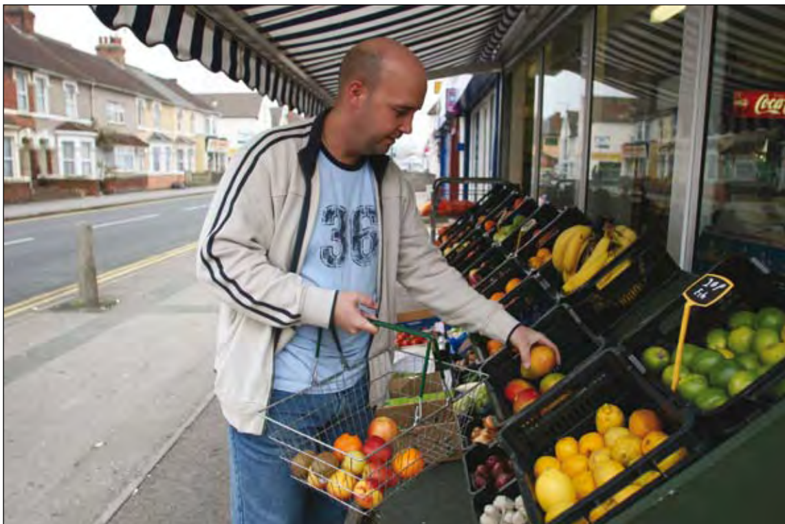
The Broad Street neighbourhood in Swindon

Organisations were generally given a free rein in terms of how and when they used their credit. It supported a wide variety of activities, examples of which are shown in Table 4.3.