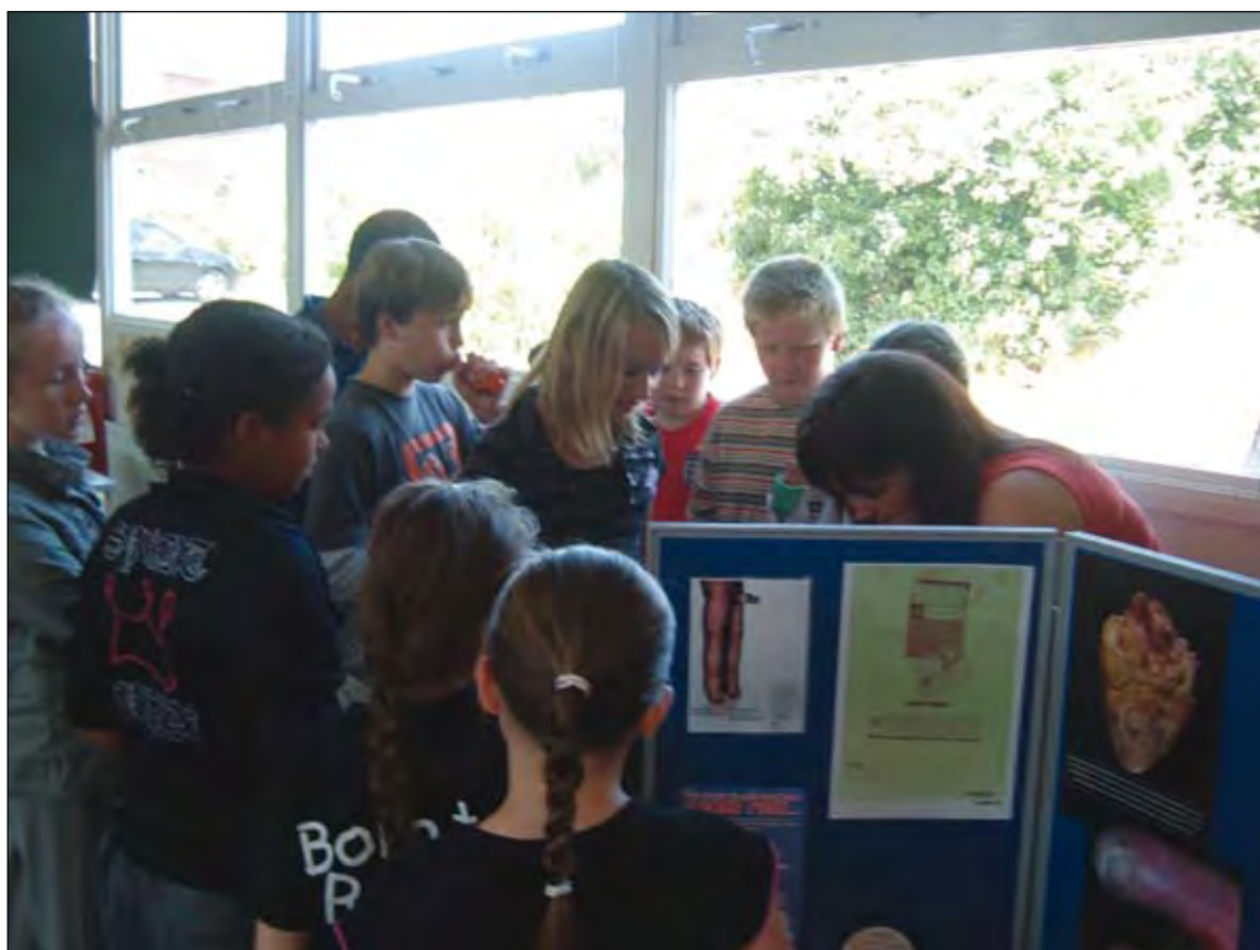
A summer playscheme in Pickersleigh, Malvern. The neighbourhood organisation here was one of the smaller ones in the Programme

We have already reported that, despite the best efforts of the Programme, four organisations failed to survive to the end of the Programme in their original form, and one more will close shortly. The particular circumstances of these failures raise questions about the capacity of even experienced organisations to manage staff or to ensure transparency in funding. However, their closure does not necessarily constitute Programme failure. In one case, the Programme identified an alternative organisation to work with in the same neighbourhood and this has now become a strong group with recognition from the local authority. In two more, there has been evidence of learning in the community or among the power holders, which may well be sustained. In the fifth case, the closure is a positive response to a job well done – a job that has ensured that capacity remains within the neighbourhood. Groups do not have to last for ever and there may be good reasons for them to fade away or be replaced – as the snakes and ladders exercise showed, out of their ashes might come something new and more viable. But, some of these organisations left a gap that will not be easily filled and their demise represents a massive loss of resources in terms of funding, local knowledge and skills, commitment and energy.