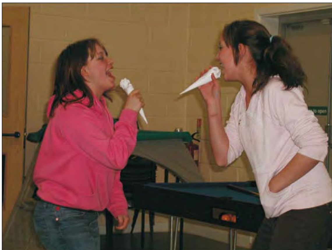
Youth work at Llanharan: 'X factor' entries from Bryncae Youth Club

The Boscombe economy seems now to be developing. Two national coffee chains have recently moved into the local shopping precinct, a full-time urban centre manager is in place and the shopping mall is undergoing a mini-refit. To date, over 70 businesses have been supported by BWCP, and this in turn has created over 100 full-time equivalent jobs.