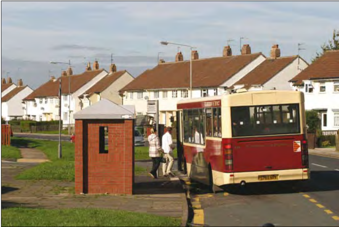
A street in Eastfield, Scarborough

Meanwhile, the reconfiguration of European funding, alongside – in England – the devolution of significant neighbourhood renewal resources to the local level, creates cause for concern. While this devolution has the potential to tailor funds to local needs and circumstances, the drive that has come from the centre for genuine community engagement will now depend very much on the understanding in each local authority and/or LSP of the resources and commitment that this entails.