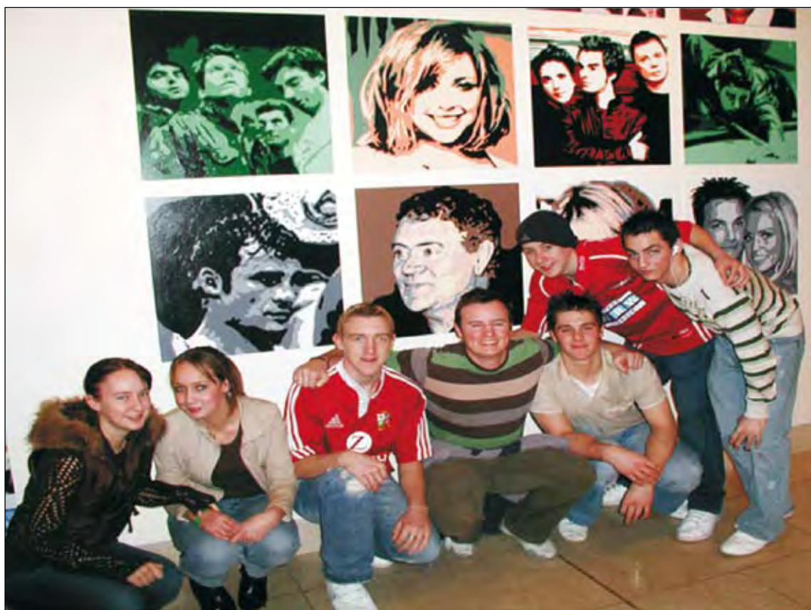
Young people from Llanharan who were involved in Cardiff Museum's On Common Ground arts project