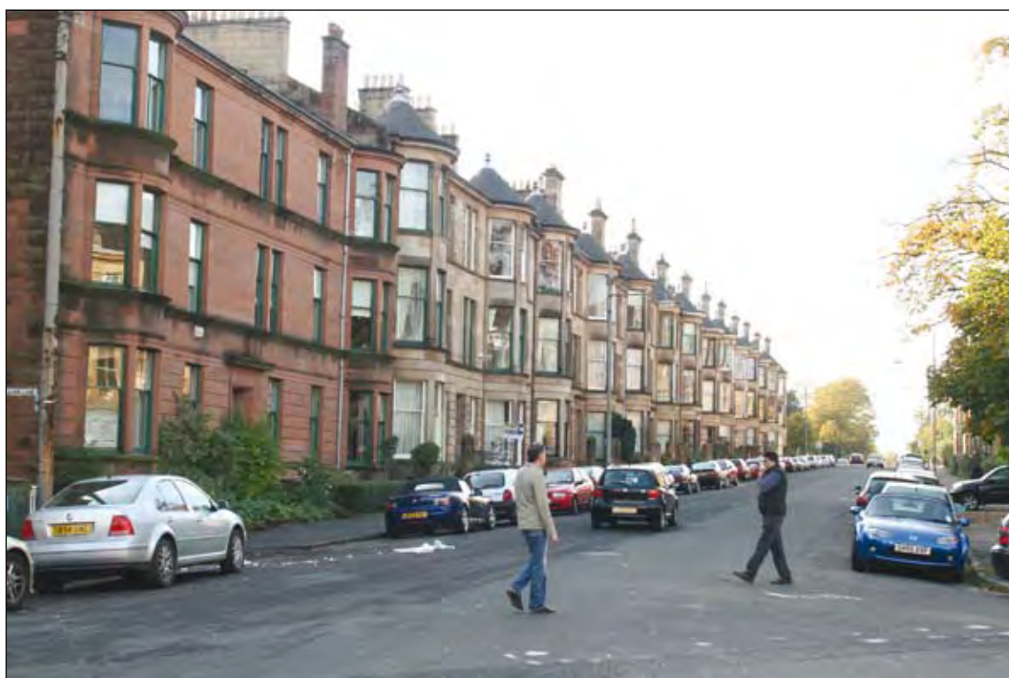
Street scene in East Pollokshields, Glasgow

In one of the networking events, we asked the Programme participants where they looked to for help; the action planning process also explored where participants might get help in the future. This suggested that answers may come from a variety of sources, some very local and some national. But when asked what resources they would still need but didn't know where to go for them, it became clear that for many organisations, it was going to be difficult to find the following, much-appreciated, resources: