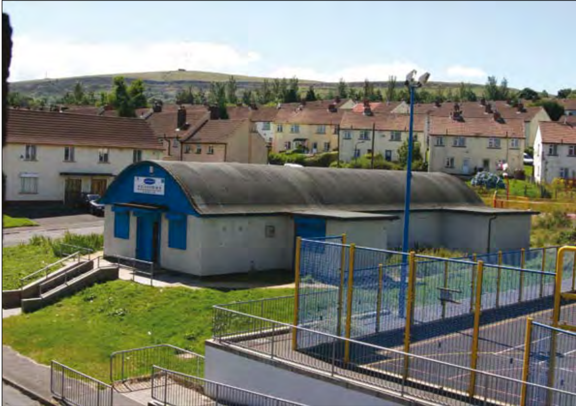
Gellideg in Merthyr Tydfil, a natural community where devolving powers to a neighbourhood organisation is paying great dividends

The Programme also highlighted the problems of partnership proliferation. The costs in people energy are high: “participants are heavily burdened from participating in a merry-go-round of partnerships”; they speak of “initiative fatigue”, “fragmentation”, “confusion” and “too many talking shops”. Pilton achieved a community-driven model of partnership with a strategic agenda involving community members and key stakeholders. This contrasted with the situation in another area in which a partnership funded by the RDA was attempting to work alongside a second, centrally funded, neighbourhood management partnership with different boundaries and a third community health partnership supported by another funding stream.