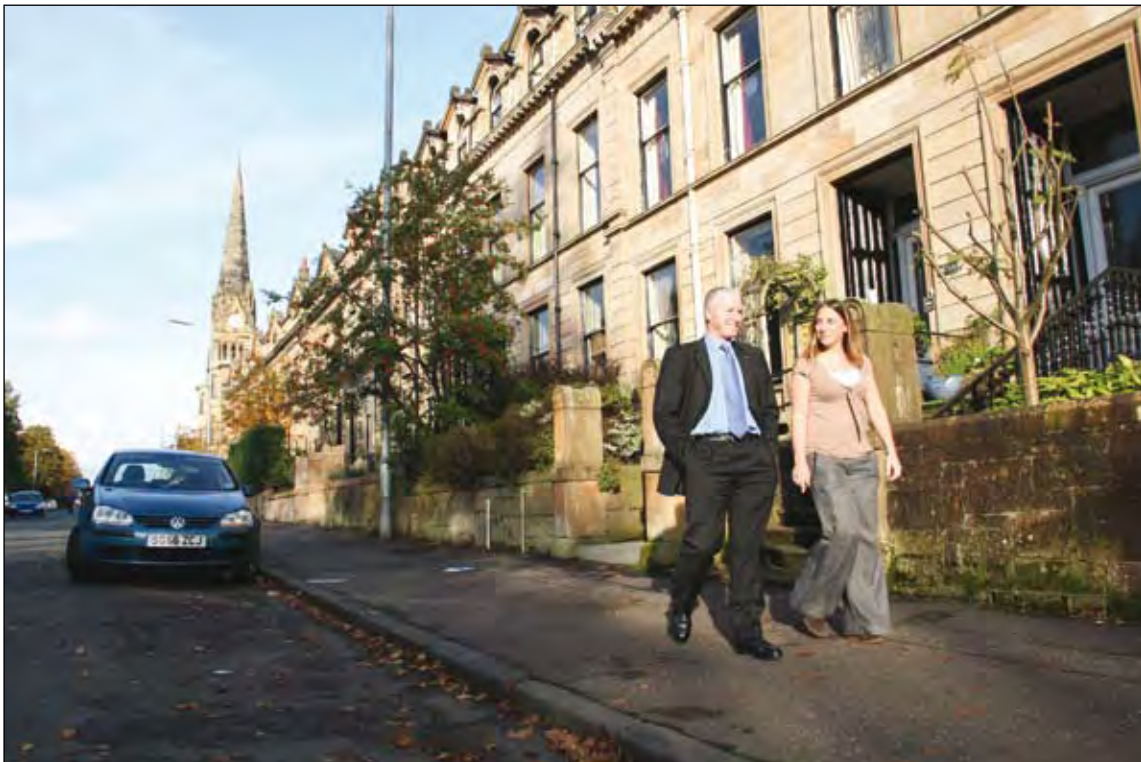
Near the offices of Southside Housing Association in East Pollokshields

In Southside , it was the local housing association that initiated the community needs survey that led the development of the East Pollokshields Partnership and potentially much greater resident influence over the community planning process in Glasgow.