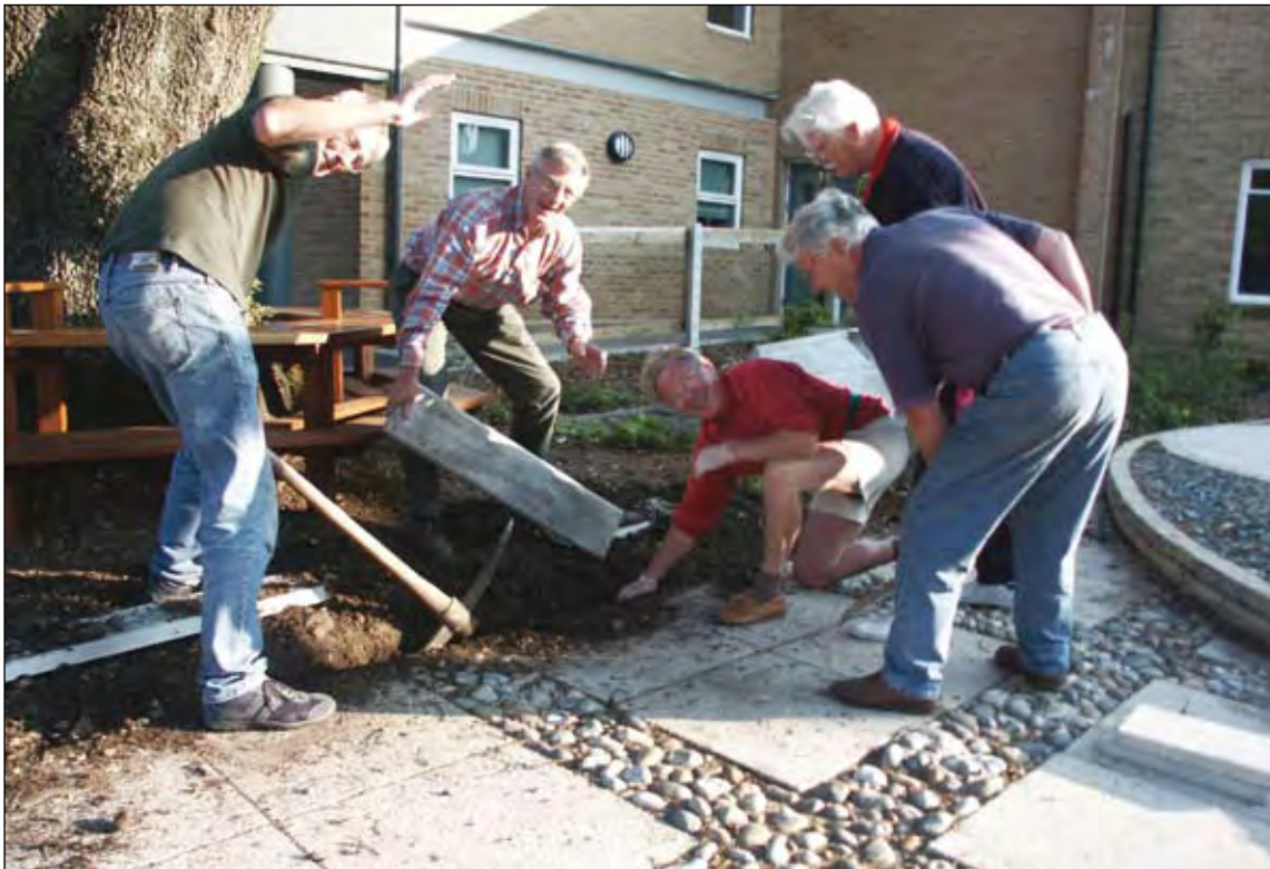
Adding the finishing touches: volunteers complete a garden of rest next to a church in Boscombe. The work was supported by Boscombe Working Community Partnership

The organisations included were at different stages of development and based in different types of neighbourhood – some were community led; others had paid workers. They ranged from informal organisations of volunteers to well-established organisations with 70-plus employees. Using information provided by the Programme participants, the evaluation team classified them according to four stages of development (see Table 2.1).