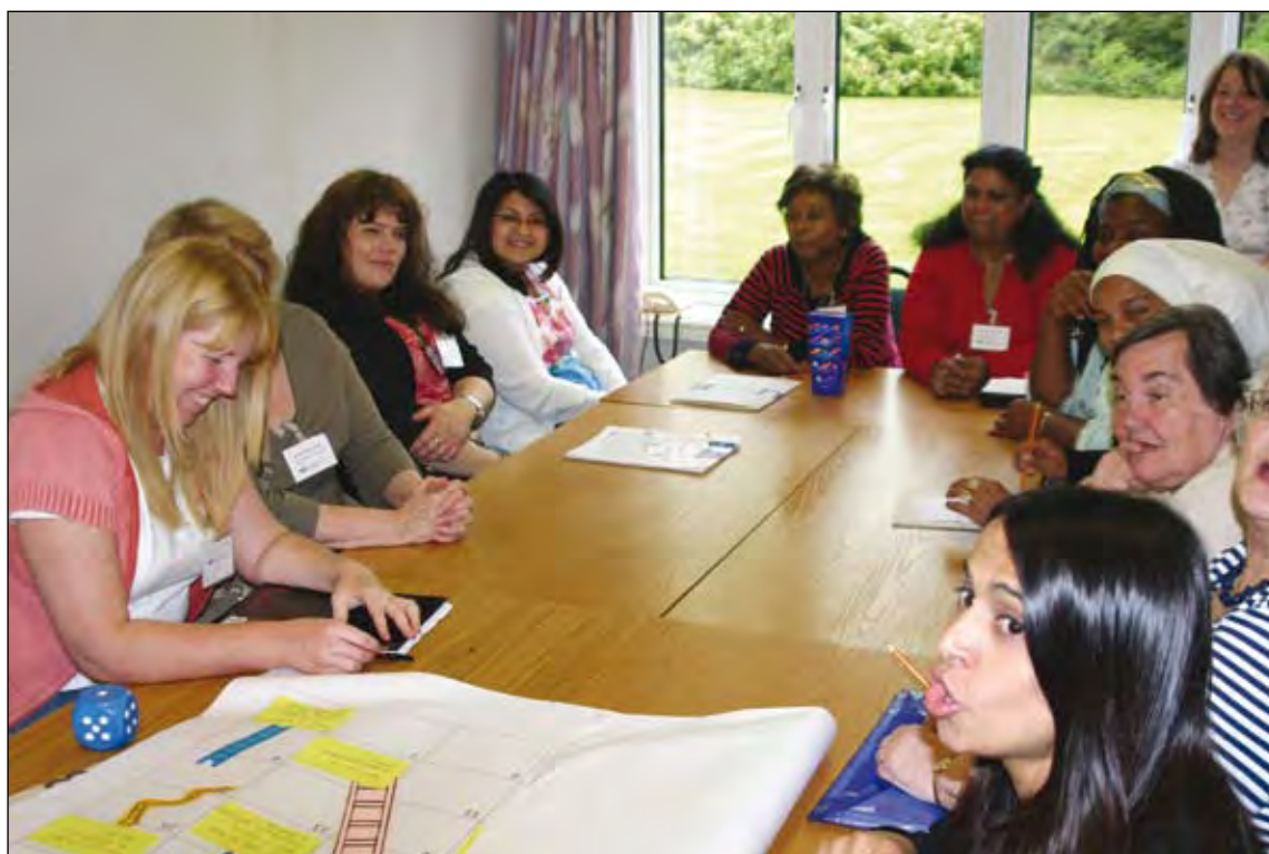
Snakes and ladders workshop in full swing at a networking event in Birmingham

The Programme also emphasised the problems that can arise from the absence of effective financial oversight. Where finance is concerned, at least one project found out the hard way that trust is not enough.