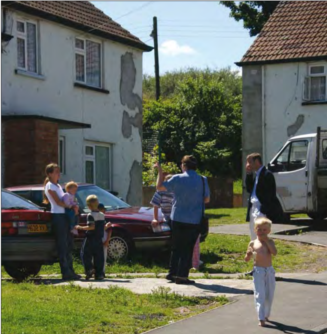
An informal get together on Gellideg estate, one of Wales's Communities First areas

Scottish policy in relation to LAAs and Community Planning, respectively, have not been replicated to the same extent in Wales. However, following the Beecham review of public service delivery, the Assembly proposes to introduce local service boards and local service agreements to encourage joint delivery and more pooling of resources. 8 There is not the same extent of devolution as in the other two countries – civil servants will be on the public service boards and there will be a strong geographical role for ministers. There is also a commitment to a citizen focus in contrast to what Beecham identified as a ‘consumer focus’ in England, and to being more ambitious about engaging citizens in the design, delivery and improvement of services – an action plan for public engagement and the role of the voluntary and community sector is planned.