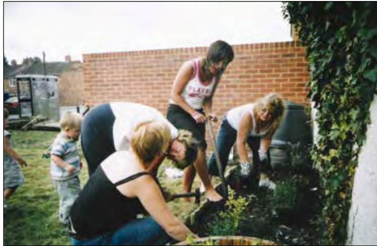
Planting out shrubs in Caia Park, Wrexham: volunteers brightening up an area of public open space

First, although a lot of knowledge exists in community organisations, it is scattered widely. JRF believed that bringing Programme participants together in networks would lead to sharing experience and joint problem solving.