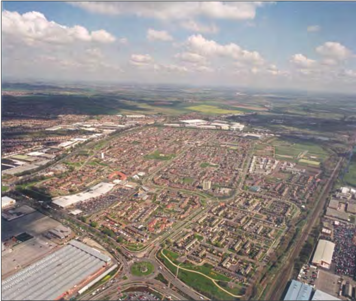
An aerial shot of a regenerated Castle Vale. The work was carried out by Castle Vale Housing Action Trust, certainly the best funded organisation in the JRF Programme

As the table shows, this light touch support has not worked for everyone. While some of the organisations, and the people within them, have grown and become much stronger, a few have made little headway. For some of the smallest and most fragile organisations, the JRF 'light touch' was too light – they would have needed a more intensive intervention to make any significant advance. Similarly, with the largest organisations it was difficult to see what the Programme could offer that would make a significant difference to them (although two of them were assiduous attendees at networking events and gave positive feedback on these). Experience suggests, therefore, that there may be a threshold of capacity and resources below which it is difficult for organisations to benefit from this kind of light touch support, and a ceiling above which it gives little added value.