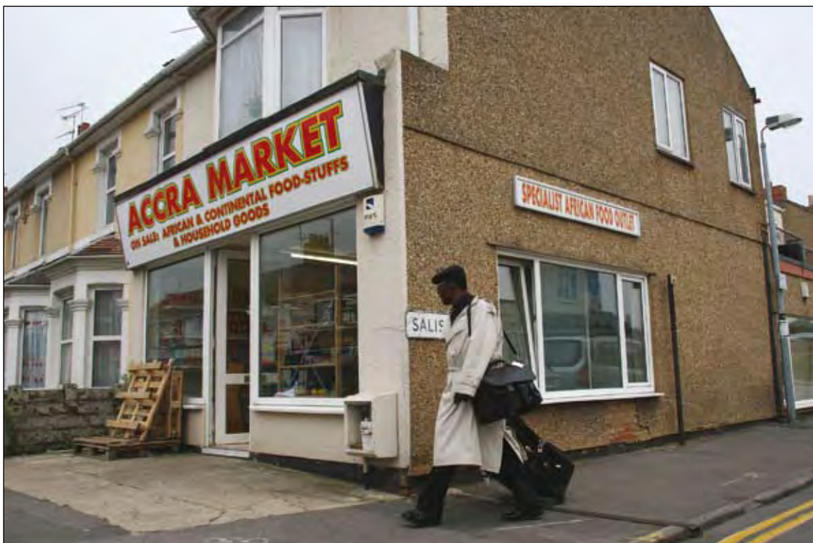
A corner shop in the Broad Street neighbourhood in Swindon

However, they also suggest that there is still some way to go before community organisations at neighbourhood level will feel that they are full partners in neighbourhood renewal. Many public authorities still do not have clear devolved mechanisms in place to engage people in policy at neighbourhood level or to ensure that mainstream departments can respond to neighbourhood priorities. And there are tensions between the emphasis on community engagement in determining priorities for the neighbourhood and contrary pressures that urge economies of scale. Rationalisation has, for example, been a strong force in the provision of housing, where despite policies to increase choice of providers, there is a strong trend for housing associations to merge and grow.