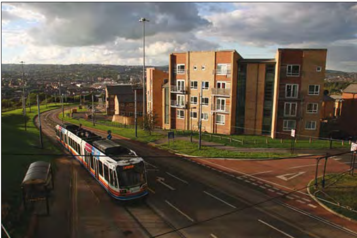
New housing on Sheffield's Norfolk Park estate

Not surprisingly then, funding and fundraising were identified by most organisations as central concerns. A big theme within action plans is the need to secure and develop community assets as a means of increasing sustainability. Llanharan Community Development Project, for example, has a full-time volunteer specialising in fundraising. Here, every staff member and trustee plays a role in fundraising and income generation and this had paid dividends. However, other organisations have struggled and are caught in a vicious circle – not having the people and skills to raise the funds to bring the people and skills they need into the organisation. Rapid changes in funding programmes and the predominance of limited-term funding streams mean that community organisations face a continual battle to achieve some form of financial sustainability and to manage complex funding packages. Even when a project has done good work, replacing significant funding can be a challenging and time-consuming task, especially where the relationship with the local authority is poor and there is local competition for resources.