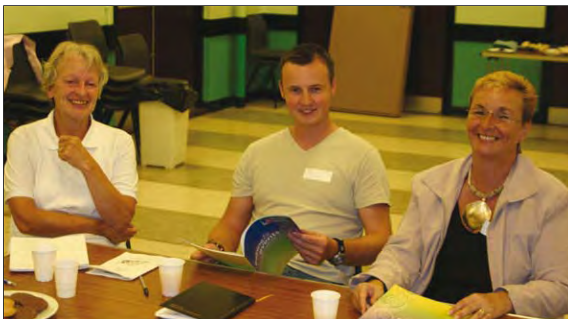
A workshop at a Wales/South West regional networking event

However, as we have seen, networking events did lead in some cases to organisations arranging visits to each other outside the formal processes of the Programme.