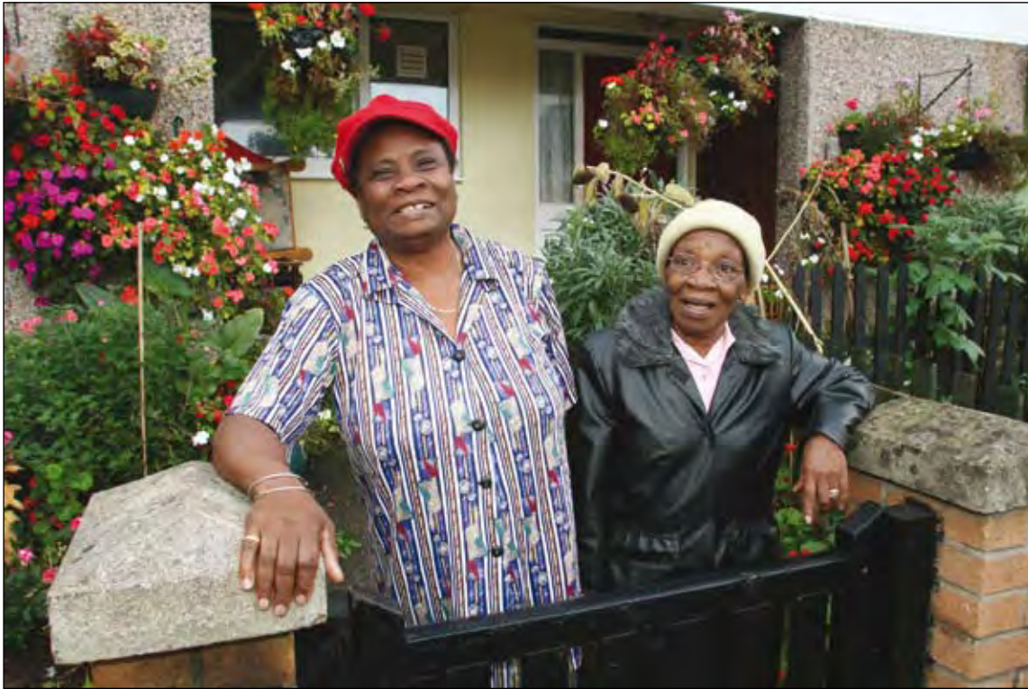
St Pauls in bloom – two residents pictured in their amazing garden

Even where organisations want to get more people involved, many lack the confidence to do so – widening participation is a continual challenge for many organisations. Chapter 3 gives examples of the ways in which Programme participants tried to engage more people. At the same time, organisations need ideas, encouragement and resources to engage more widely; or they may need to be challenged to find ways of reaching more people. A trusted advisor can do this. Small amounts of money with no strings attached make it possible to lay on events and initiatives that reach a wider community. Opportunities for organisations to meet, share ideas and gain inspiration from each other can play a significant role in encouraging Programme participants ‘not to give up’.