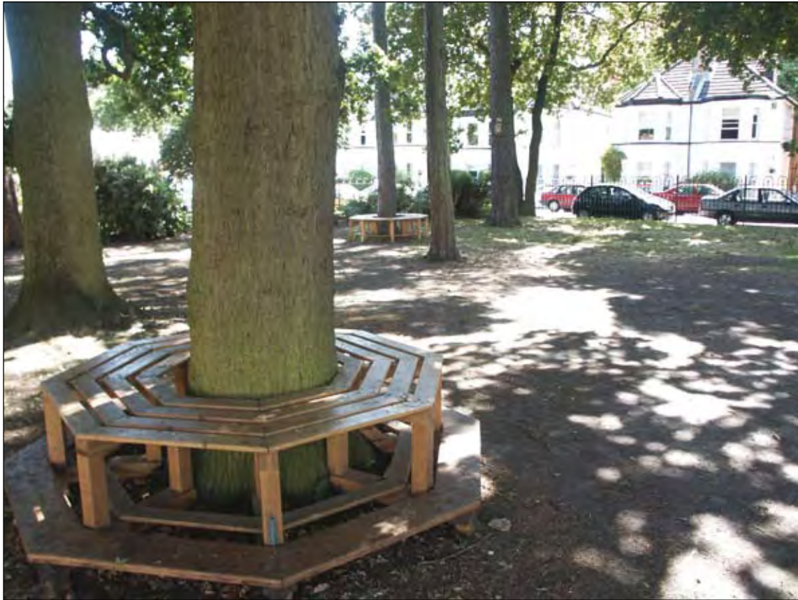
Public open space improved by Boscombe Working Community Partnership