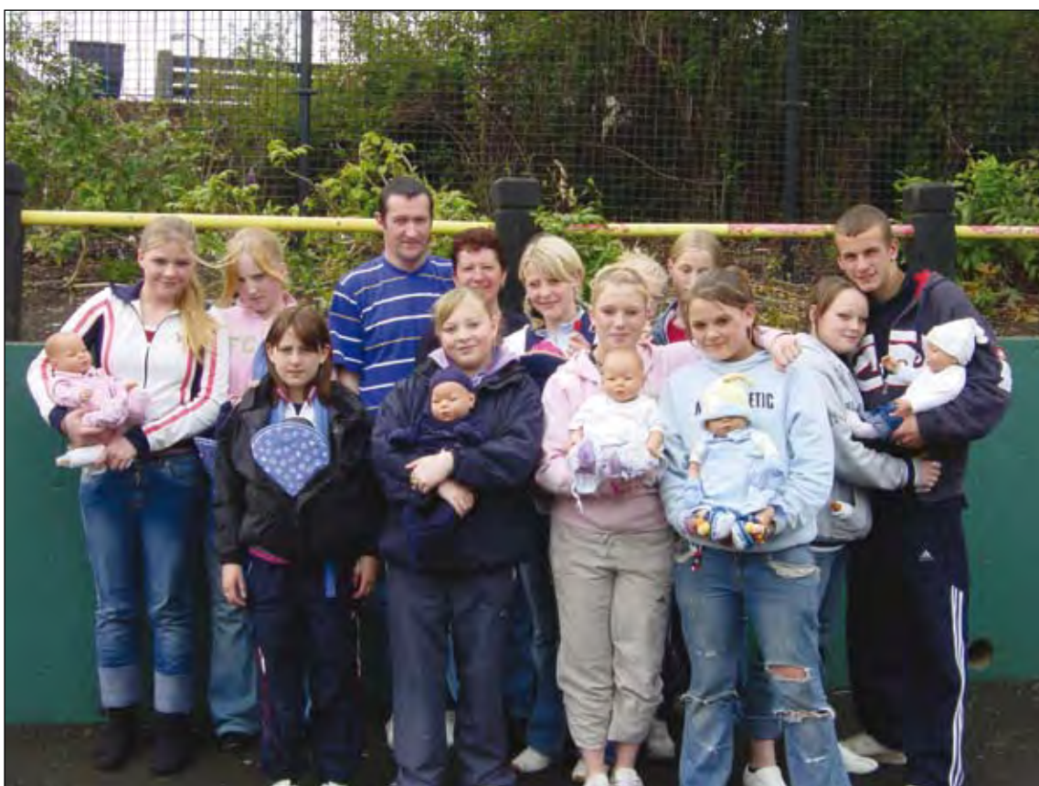
Boothtown Youth Forum: baby reality session

The need to reach out to young people was a priority for many of the organisations in the Programme when they started. This is particularly important in a climate where any group of young people gathering in a public place tends to be seen as a community safety risk. Working with young people not only addresses the generational gap. It breeds the active citizens of the future and can help to get parents involved.