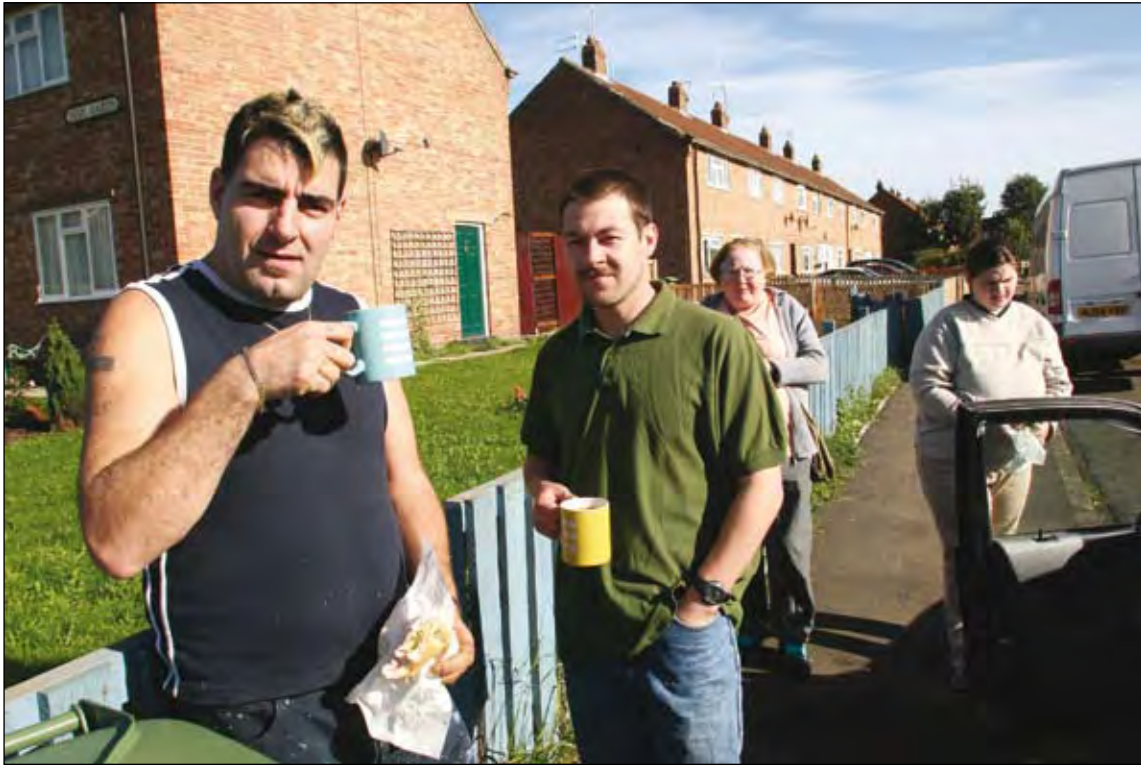
Anyone for a cuppa? Residents at Eastfield, Scarborough, out enjoying the sunshine

Programme claimed that they were frequently ignored by local decision makers and even if they did sit on formal partnerships, partners still took decisions ‘over their heads’.