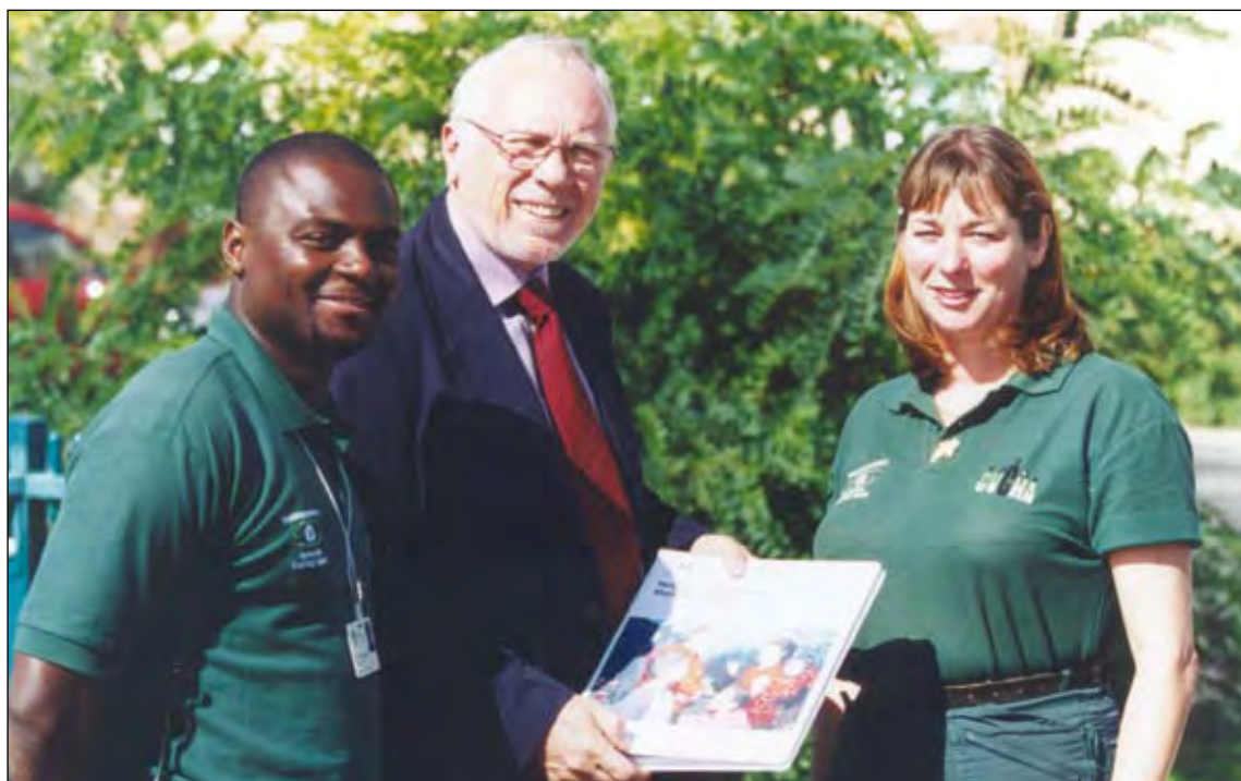
Lord Rooker with community wardens in Castle Vale

Government in England has committed itself to the support of the third sector infrastructure through Change Up and Capacity Builders. It is essential that these initiatives in England and parallel initiatives in Scotland and Wales invest in the capacity of the infrastructure to support voice as well as service delivery. In England, regional and sub-regional Change Up strategies should provide an ideal opportunity for building in this kind of support. In all three countries, local and regional bodies are well placed to act as 'resource centres', dispensing credit and developing a network of facilitators who could be 'at the end of a phone' and who would be available for mediation in a crisis. However, experience suggests that facilitation should be independent of any single organisation or sector, and that facilitators should bring regional or national experience with them. There is a value, too, in brokers not being from the immediate locality. This may mean that facilitation and mediation is best provided at regional level.