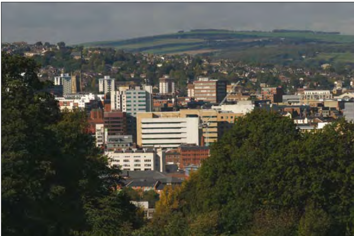
One of Norfolk Park's strongest assets: its fine view across the city of Sheffield