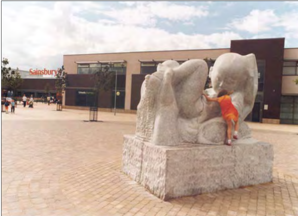
Part of the transformation: a commercial development in Castle Vale, complete with public art

resisted the need for yet another plan. Indeed, the more professionalised an organisation became, the more likely it was to engage in some form of planning.