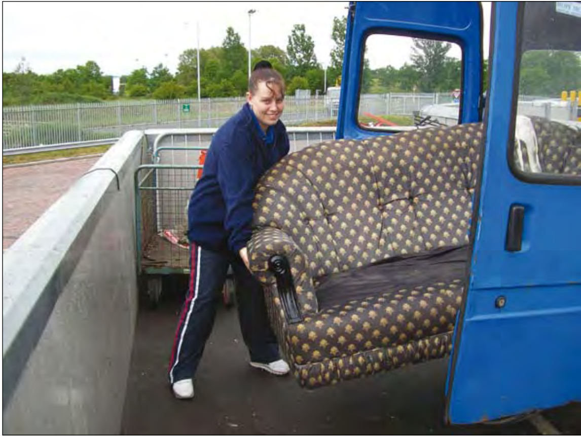
Will it go in? Wrexham's Caia Park Tenancy Support Team moving furniture