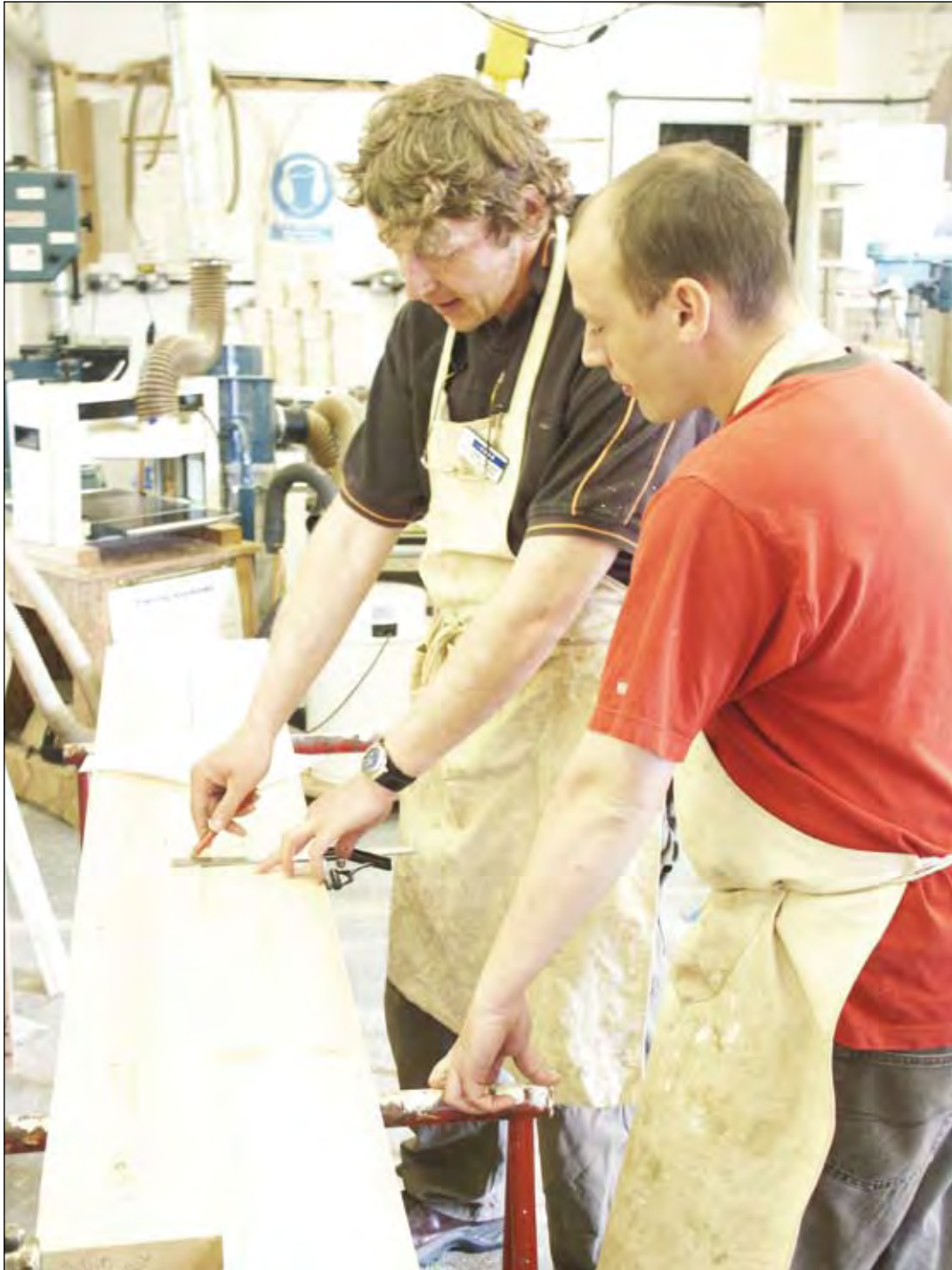
A joinery workshop supported by Boscombe Working Community Partnership

There are also many examples of both interest and positive working in recent publications from both the Improvement and Development Agency (IDeA) 11 and the Local Government Association (LGA). 12