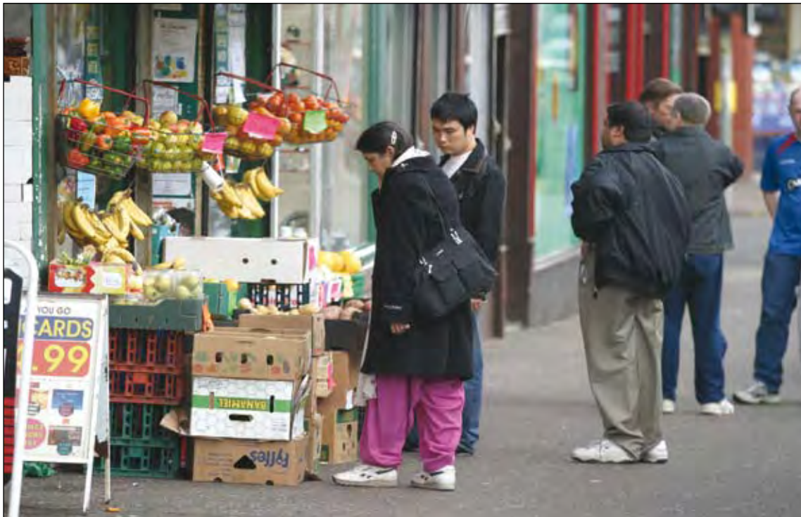
Shopping in Glasgow's East Pollokshields, where local groups have joined forces behind a Community Plan

mixed tenure. The Executive is encouraging developers and registered social landlords (RSLs) to build for sale or rent in the most deprived neighbourhoods, as well as investing in new housing in support of local regeneration priorities and introducing housing renewal areas to tackle poor and declining housing standards.