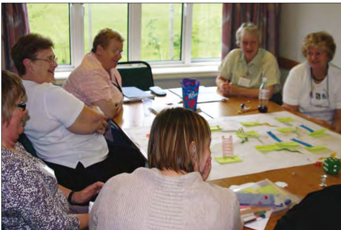
Delegates enjoying a workshop at one of the national networking events

‘The networking events were excellent. Initially it was just the Welsh groups meeting which was really good, but when we joined together with the West Country groups it was excellent. These gave the opportunity for visits to other projects, something that just would not have happened without JRF.’