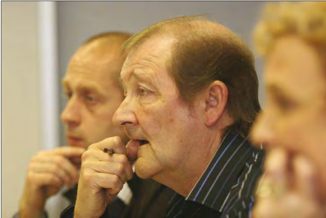
Building trust takes time: a mix of residents and council officers at a meeting of Scarborough's Eastfield Neighbourhood Partnership

The capacity of local authorities to engage people is also affected by the pace of policy change. Trust depends on forging relationships with key individuals and individuals in the public sector often move very quickly. If continuity is not feasible, then the links have to be spread more widely and engagement needs to be built into the culture through induction, training (particularly joint training), secondments, promotion requirements, executive appointments and supervision. While the tools exist to do this with officers, if the local authority is willing to use them, getting those councillors to take up training and other opportunities can be more of a challenge. Some still find it difficult to reconcile their role as an elected councillor with the need to engage communities. The three countries face different challenges in this respect, but in all three, local government infrastructure bodies – preferably working in partnership with the relevant infrastructure organisations from the community sector – will have a critical role to play in both promoting good practice and challenging failure effectively. They might also consider how the kind of light touch support the Programme has provided for communities could be provided for officers and councillors with a particular brief to work with communities.