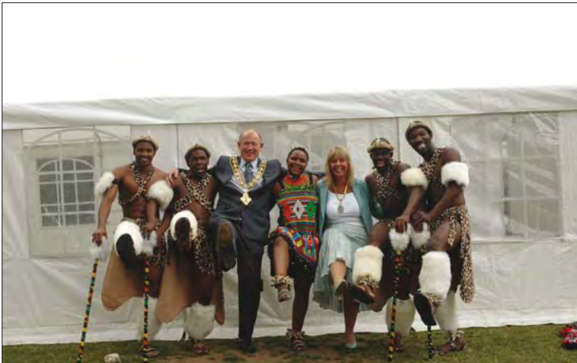
The Mayor of Halifax – and Zulu dancers – get into a knees-up at the Boothtown Festival

Joining an existing group can be difficult. Residents need a variety of informal ways into engagement with the people they know and trust, especially those who feel marginalised or isolated within the neighbourhood. In Malvern, the community development worker recruited some local residents to invite their friends round for an informal discussion in their own homes. This worked well, for a number of reasons. First there was no distance to travel. Second, residents were with people they knew well. They were invited by word of mouth – as one of the facilitators said: “It’s people that bring people, not posters or leaflets”. Third, the provision of some simple statistics and facts about the area gave residents a place to start and endorsed their own views of the problems on the estate.