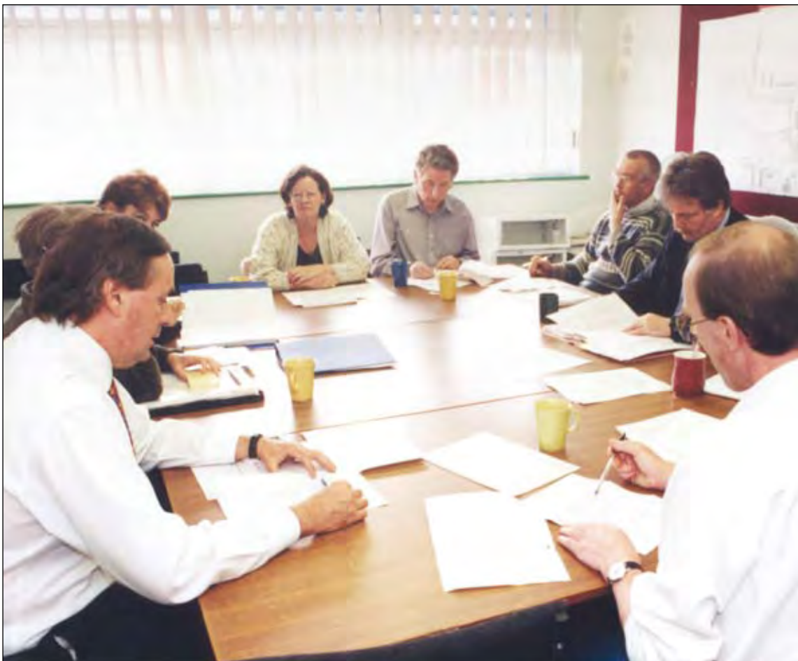
A meeting of the Tenants and Residents Association in Castle Vale, Birmingham

In the remainder of this chapter, we draw on the experience of the 20 organisations in the Programme to look first at where support is most needed and what policy makers can do to maximise this support. We then consider where the support might come from, before ending with recommendations for national government, local public authorities and service providers and infrastructure bodies in government and the third sector.