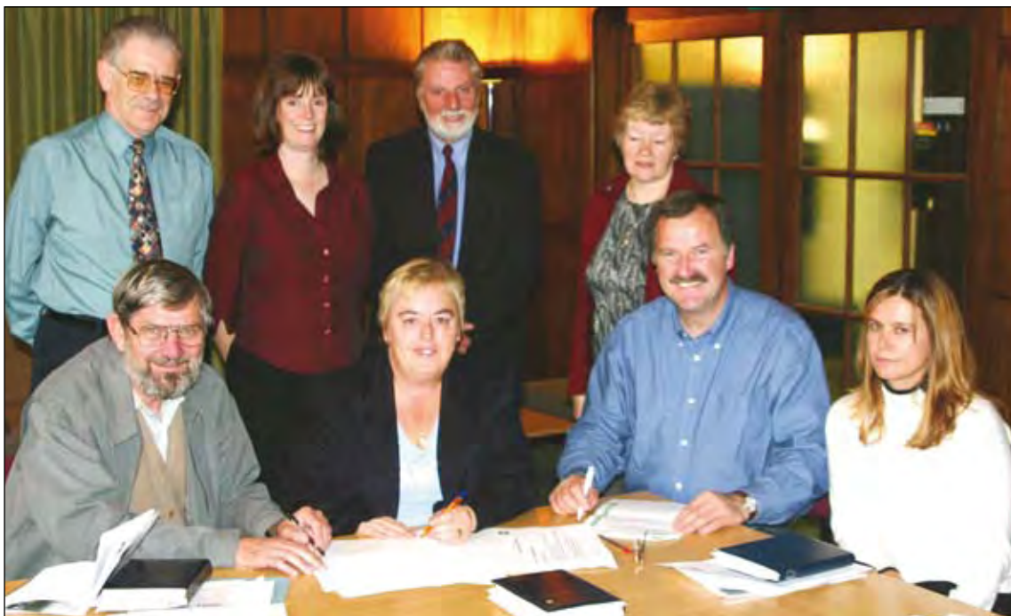
Agencies in Caia Park sign the protocol for joint working