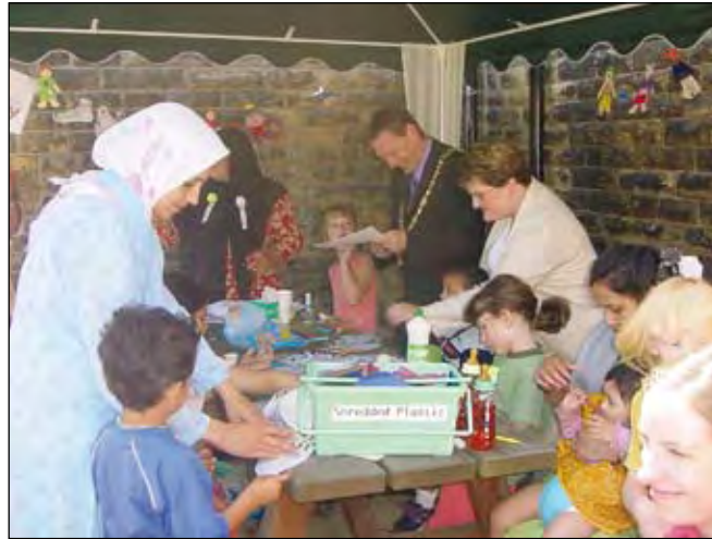
Todmorden in Calderdale: a summer playscheme organised by Integrate