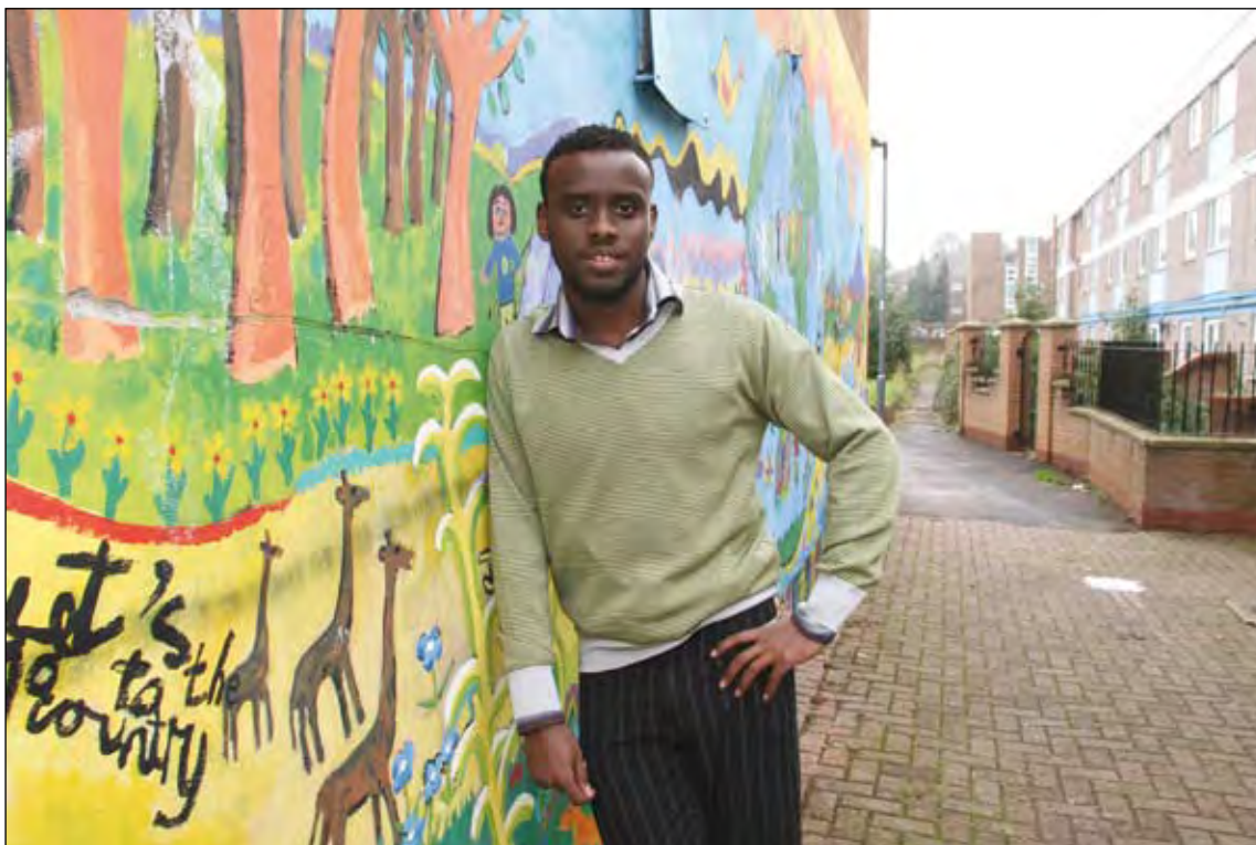
One of the several murals that add a splash of colour to life in St Pauls, Bristol