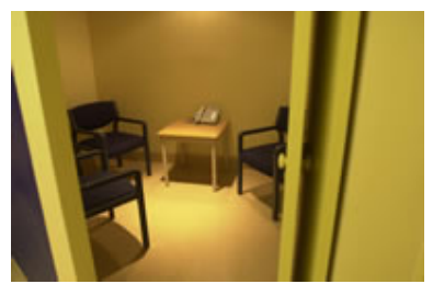
After Care Area

The After Care Area is where the clients remain under observation until they are ready to leave. Counsellors and social welfare staff are on hand to link clients with other services including housing, legal, social welfare drug treatment and rehabilitation.