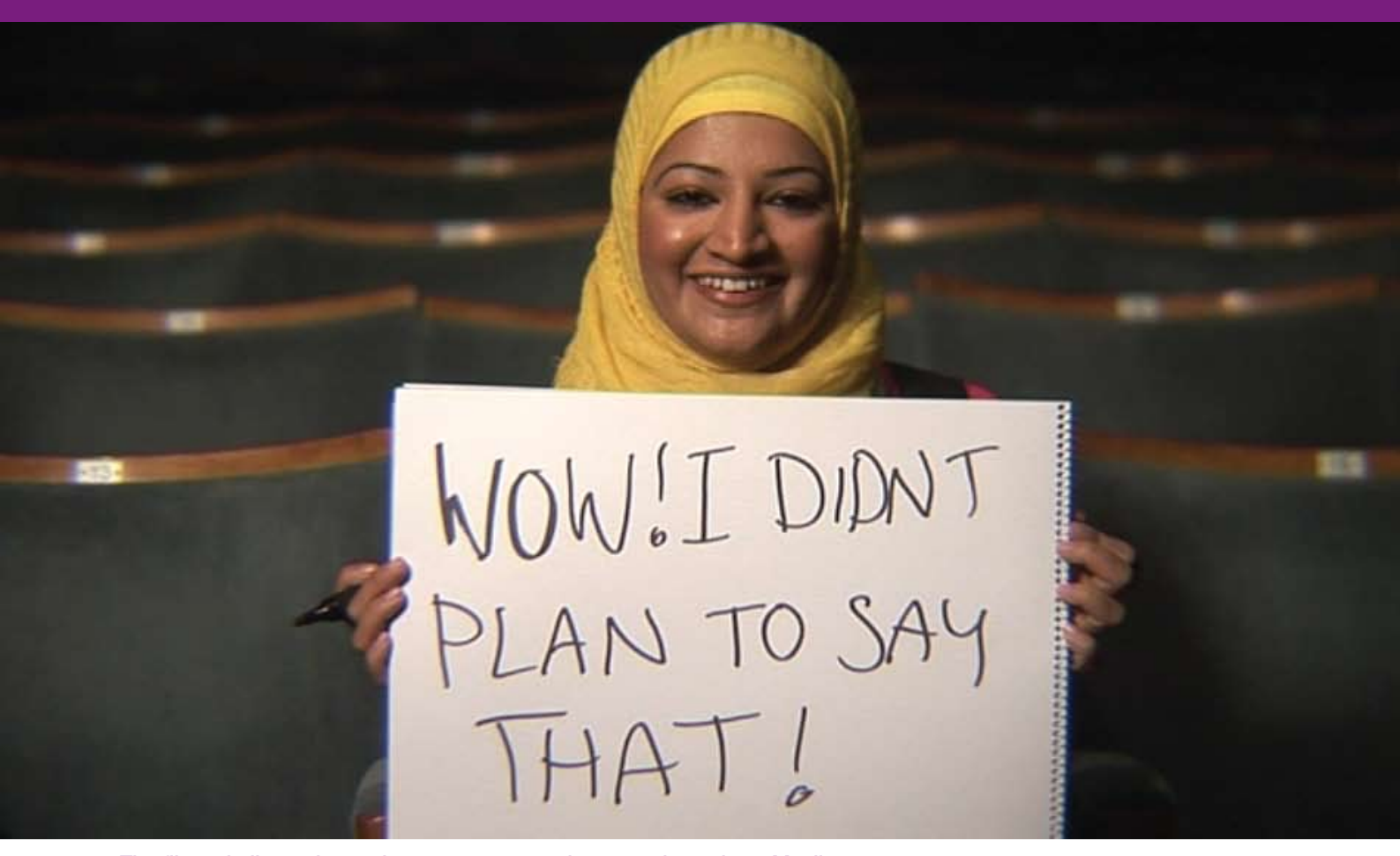
The films challenged negative stereotypes and assumptions about Muslim women.